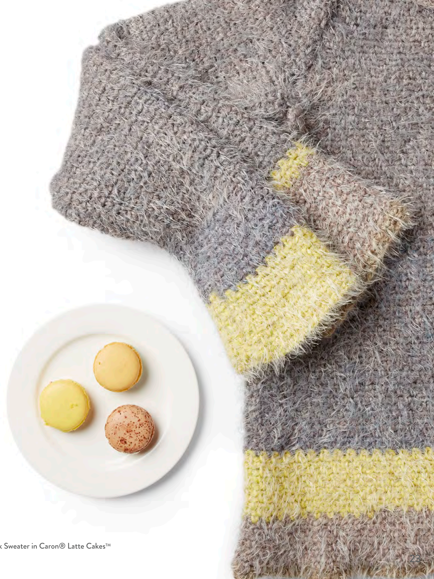
Featured Pattern: Crochet Cowl Neck Sweater in Caron® Latte Cakes™