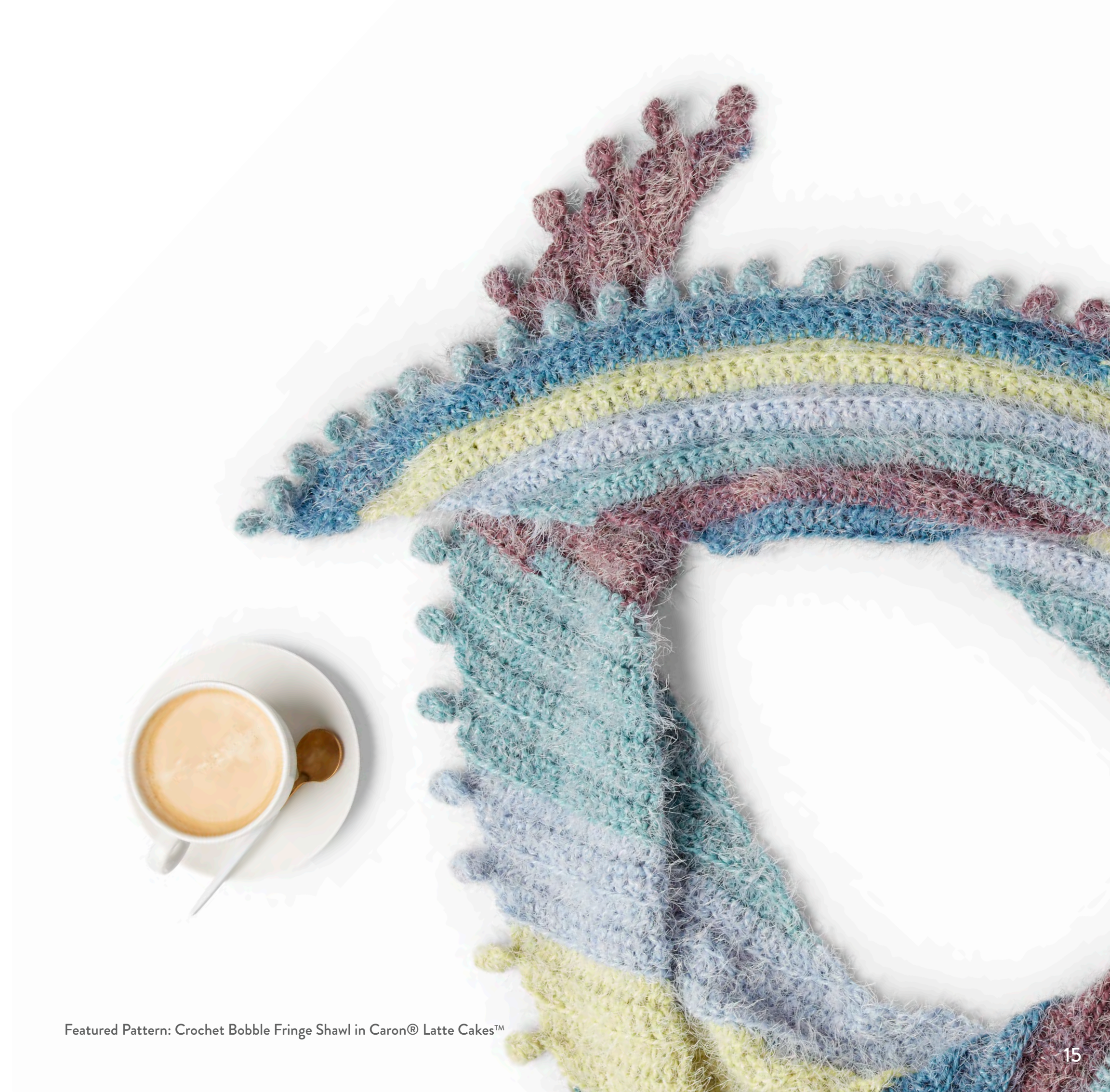
Featured Pattern: Crochet Bobble Fringe Shawl in Caron® Latte Cakes™