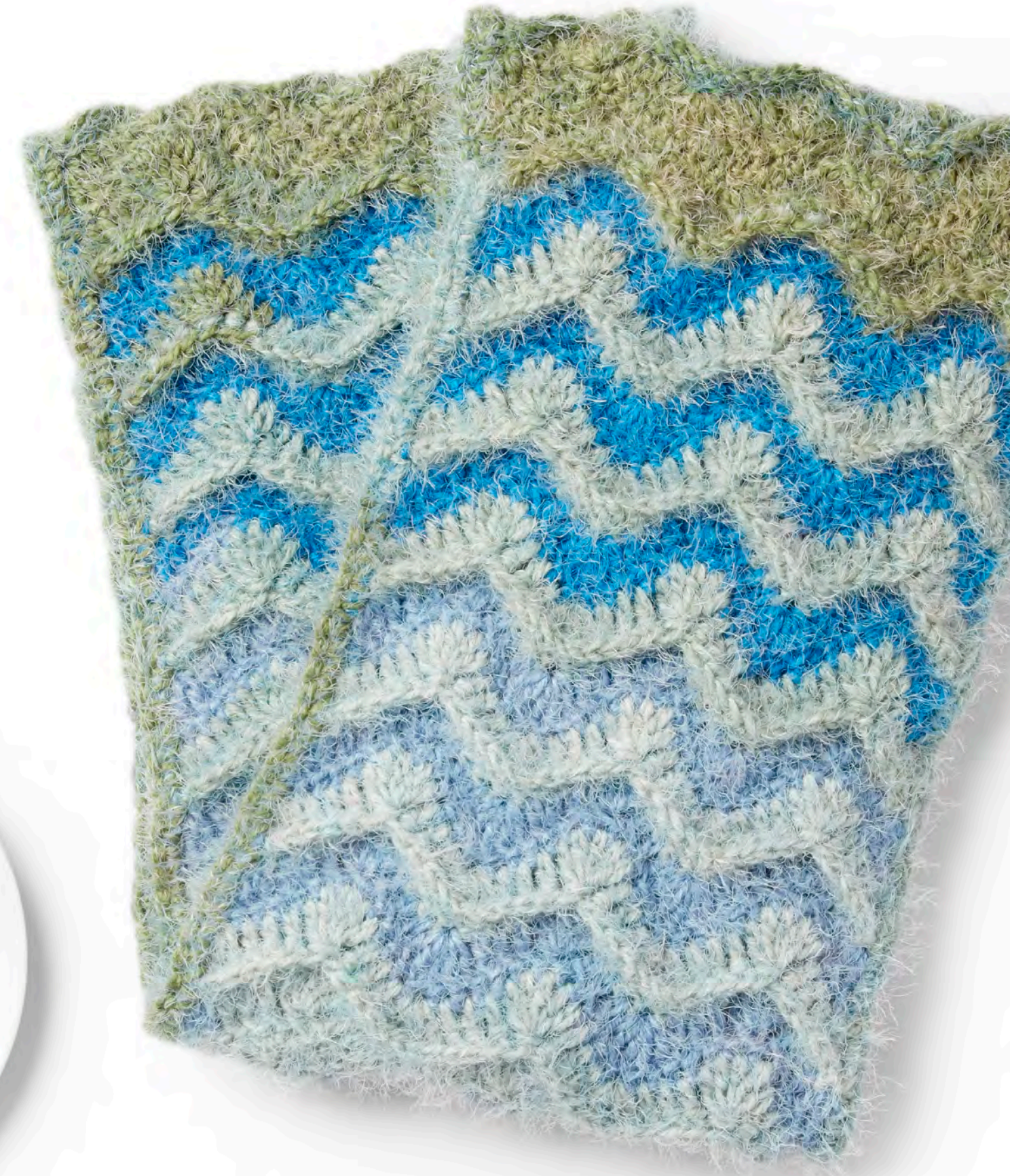
Featured Pattern: Ripple Effect Crochet Cowl in Caron® Latte Cakes™