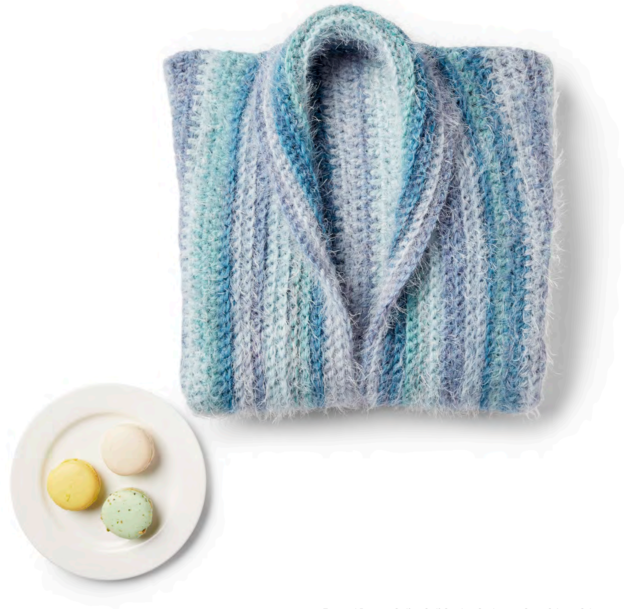
Featured Pattern: Cuff to Cuff Crochet Cardigan in Caron® Latte Cakes™